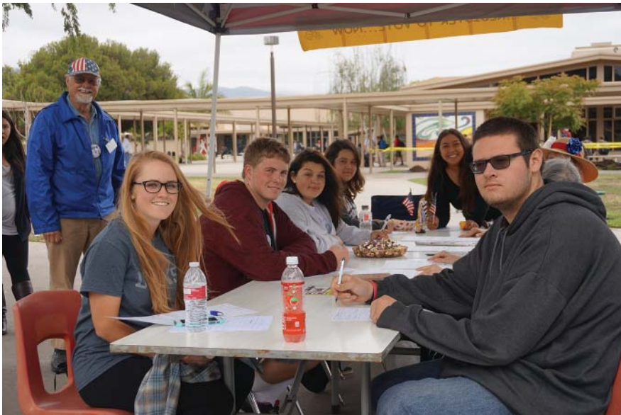
League members registering Carpinteria High School student voters