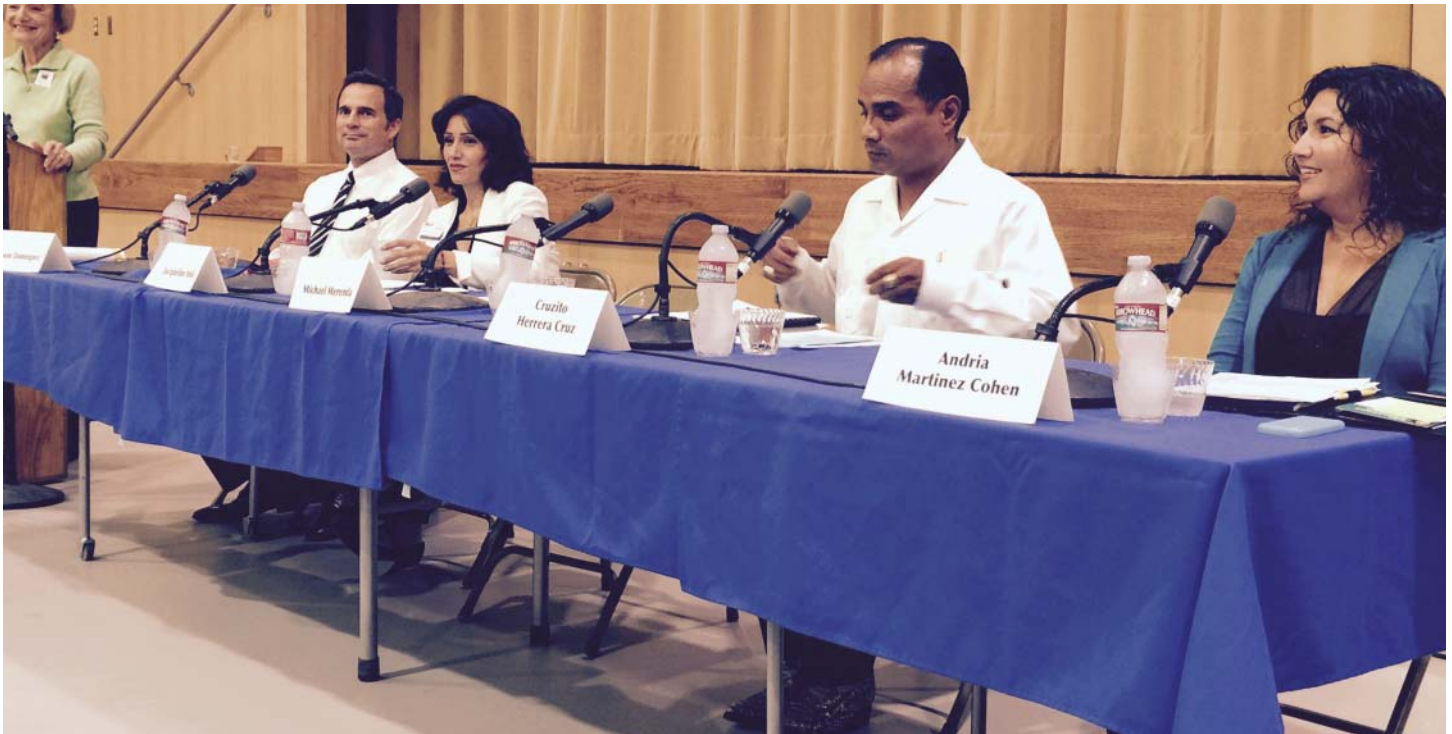
District 1 Candidates Forum participants