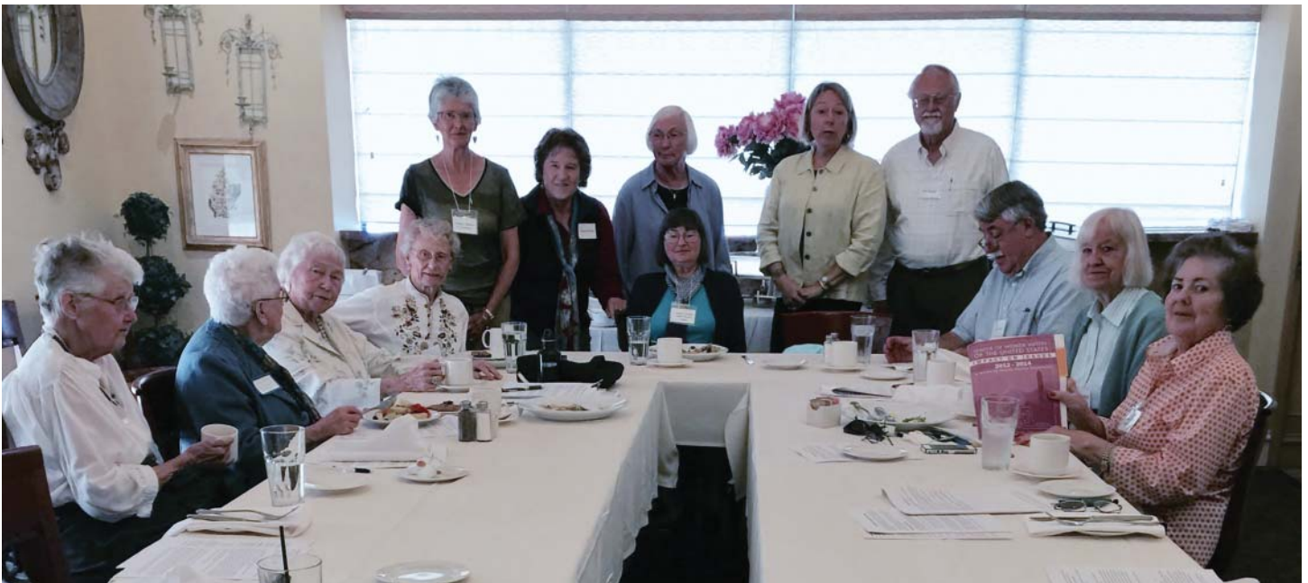
Consensus Meeting on How Could We Amend the U.S. Constitution?

The League strongly recommended using the City's Creeks Restoration Fund for the purchase of the former Veronica Meadows project site. The protection of the Arroyo Burro, which leads to so many public lands, will be very important to the health of the City's watershed. This property will also provide additional open space, and contains sensitive riparian, aquatic and avian habitats. LWVSB joined the Parks and Recreation Commission and the Creeks Advisory Committee in recommending this purchase.