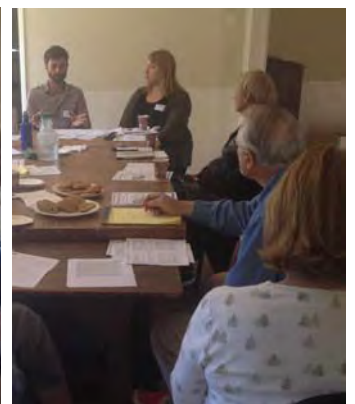
A full table at the February Carpinteria Discussion Unit on Affordable Housing in a Post-Redevelopment World. See Calendar on page 8 for all unit times and places.