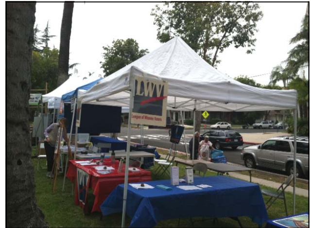
The League at Earth Day