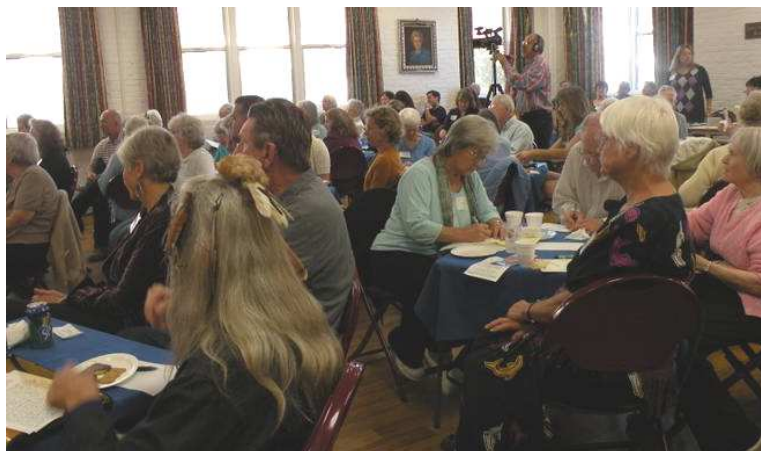
It was a full house for the October Community Forum, "Restorative Justice Not Jail for the Homeless."