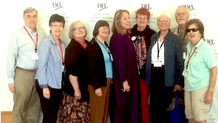
Local Convention Delegates