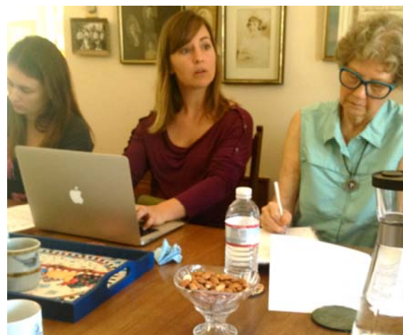
League members plan for the year.

Be sure to look for email messages from "LWV of Santa Barbara." And follow us on Facebook and Twitter.