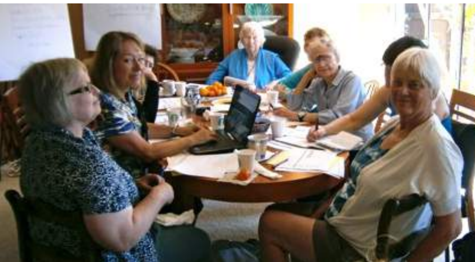
League members planning fall programs

I am glad indeed that I was able to participate in the League earlier in my life, as it was an invaluable education in political and governmental action and a lesson in non-partisan research as well as the bi-partisan decision-making process that is hard to find in today’s political world.