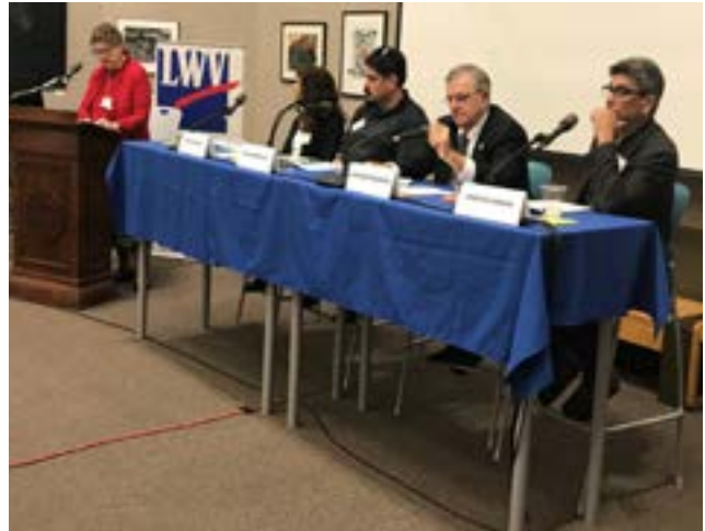
Immigration Panel November Community Forum

Our Members' Holiday Party is December 20, noon, with delicious dishes & elected officials from Carpinteria City Council, Goleta City Council, and City of Santa Barbara City Council as guests. Come ready for an informal sociable time with them and questions for the City of Santa Barbara's newly elected officials. The location is our old meeting spot, Louise Lowry Davis Center. Sign up or call the office with your donation for luncheon items or donation in lieu of food. We always welcome volunteers to help with this festive event.