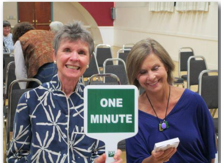
Goleta Water District Candidate Forum Timers

The Channel Voter is published four times a year, in September, November (for November, December and January), February and April by the League of Women Voters of Santa Barbara, 328 East Carrillo Street, Suite A, Santa Barbara, CA 93101.