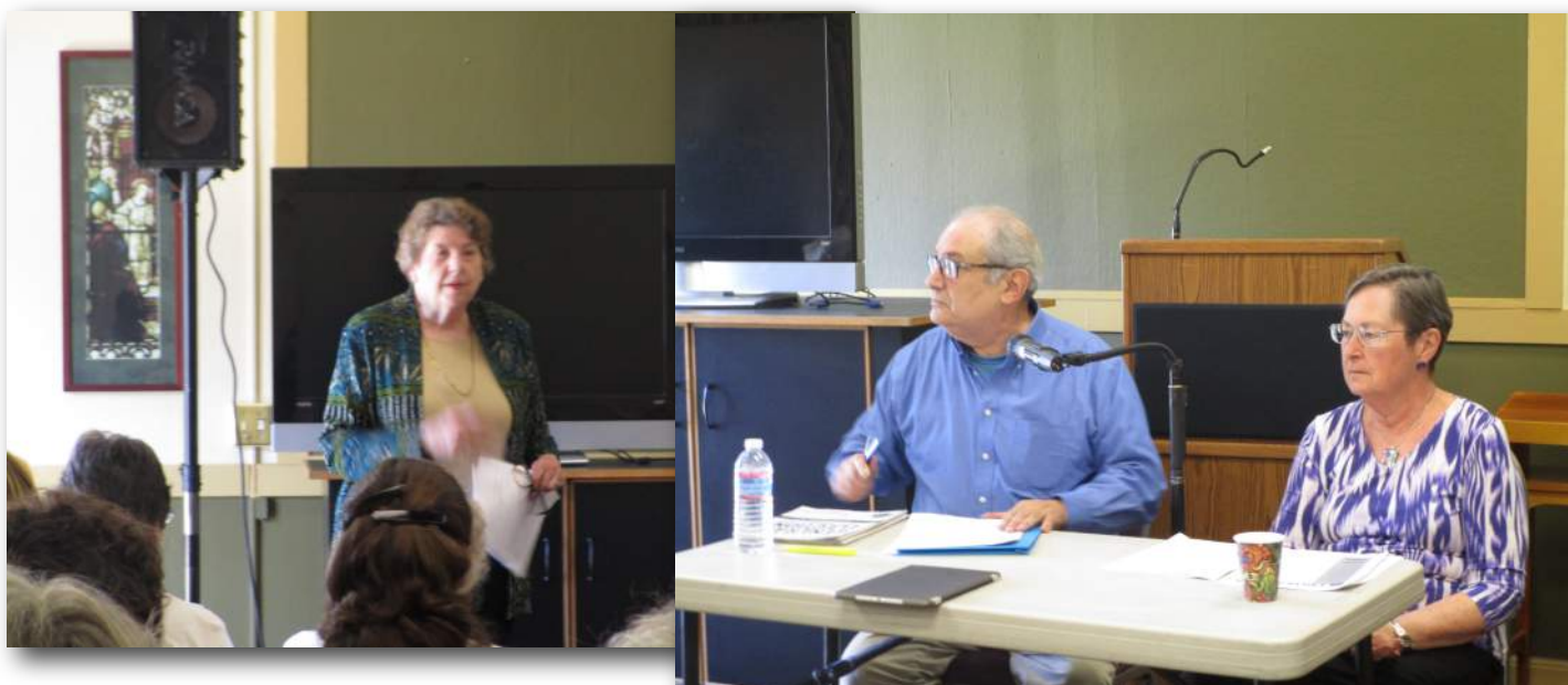
Top, Ballot Measure Pros & Cons. Bottom, Community Forum on Measure P