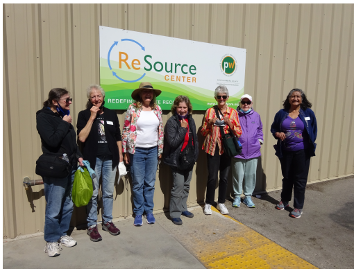
League members visit County ReSource Center and Tajiguas Landfill shortly before the Alisal Fire came close to the Center