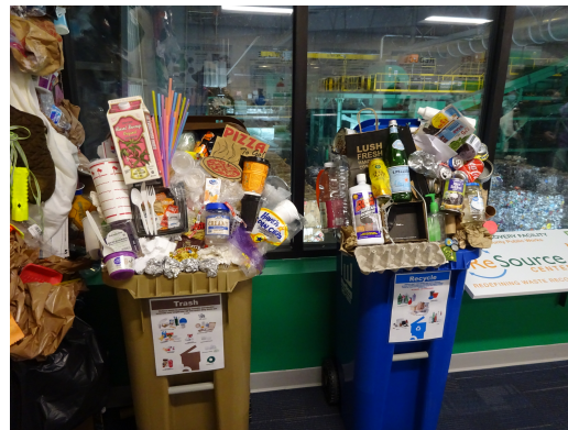
Recycling: what goes in which bin